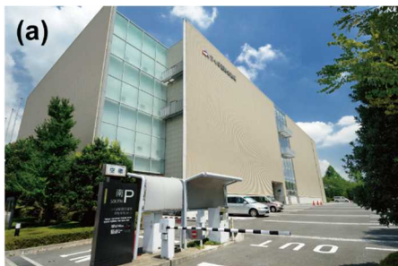
Fig. (a) Tsukuba International Congress Center, (b) participants and presentations in recent ISS